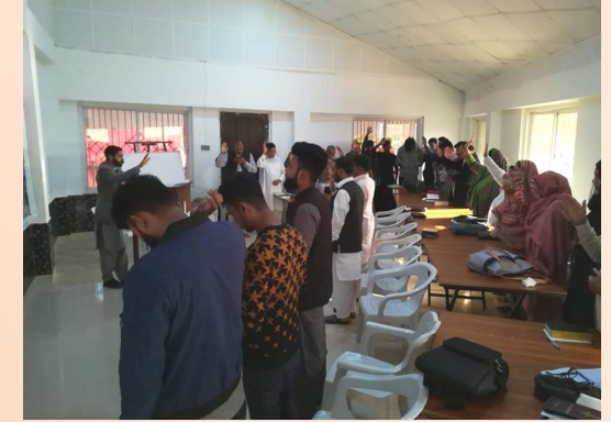
May 2019 • Volume XI, Issue V The Frontier News

During the programme participants were divided into groups and were given written assignments to be presented by their group leaders. The speakers advised the participants to read books and use libraries for research and further study to enhance their knowledge.