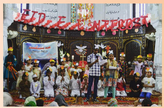
Children presenting a skit on Pentecost Day

The Pentecost Day, 2019 was celebrated with religious zeal at all the Churches of the Diocese of Peshawar. Special Prayers and worship services regarding the Pentecost Day were organized and attended by a large number of people who received blessings of the Pentecost Day.