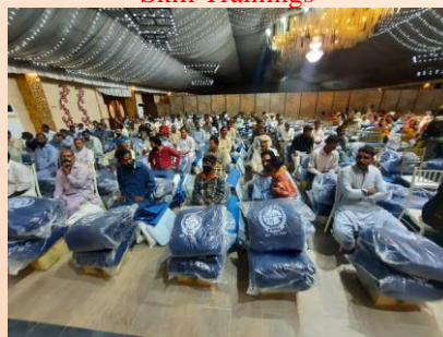
Relief Activity at Jaranawala