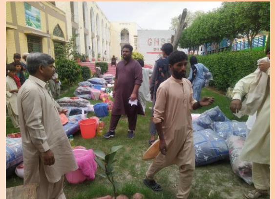
Flood Relief Activity in Images