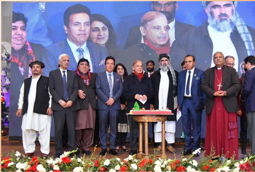
Christmas Celebrations at Prime Minister House