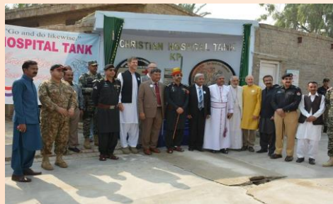
Christian Hospital, Tank

Apart from the above mentioned services the Diocesan Mental Health Centre caters for Children with Special Needs through Special Education, and also provide Counseling services to both the parents and the Christian Community at large.