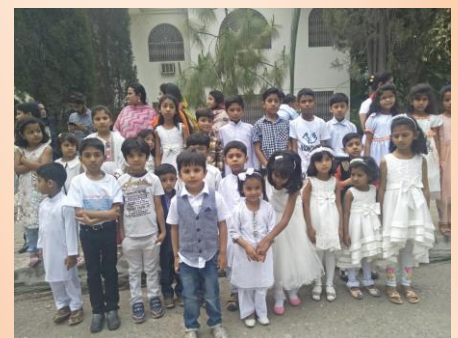
Junior Church, Diocese of Peshawar