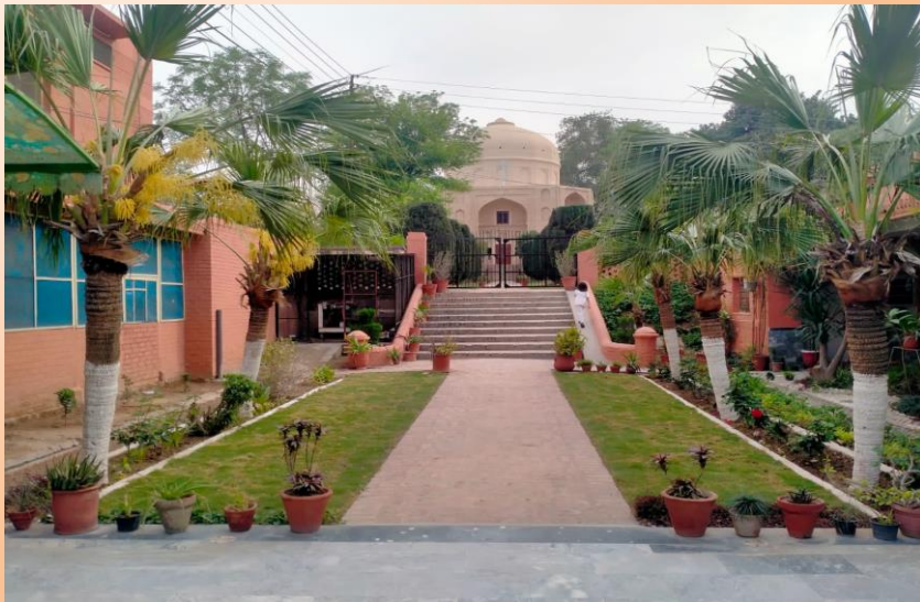
Mission Hospital, Peshawar