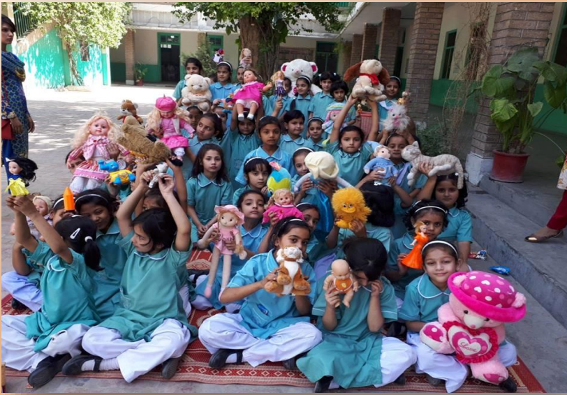
Diocesan Schools Curricular and Co-Curricular Activities in images