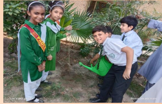
Diocesan School Curricular and Co-Curricular Activities