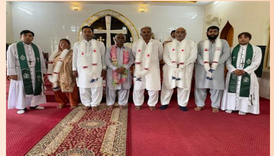
Newly Constructed Tarbella Church

The Diocesan Health Sector provides Preventive, Curative and Rehabilitative Services to the communities throughout the Province. These services are rendered through Hospitals, Clinics, and Health Centers. Communities are also reached through Free Medical Camps in the far flung areas.