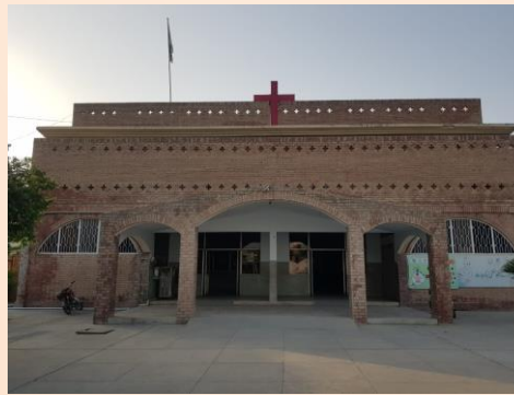
Pannell Memorial Hospital, Bannu

The Diocesan Health Sector provides Preventive, Curative and Rehabilitative Services to the communities throughout the Province. These services are rendered through Hospitals, Clinics, and Health Centers. Communities are also reached through Free Medical Camps in the far flung areas.