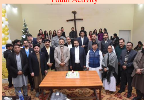
Multi-Faith & Ecumenical Leaders at Diocese of Peshawar Church of Pakistan