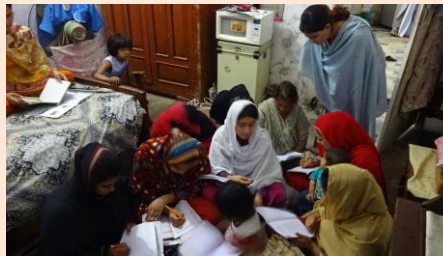
Adult Literacy Classes

The Development Sector through its various programs and projects, such as Skills Training Programs, Women Empowerment Projects, Adult Literacy Program, Sewing Skills and Interfaith Harmony Programs helps to rebuild self-confidence of the individuals from oppressed communities, thus improves their quality of life, as well.