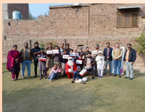
Mental Health Centre, Peshawar