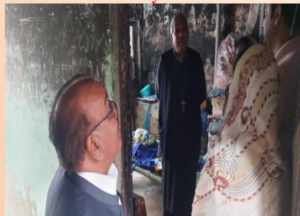
Jaranawala Survey in images