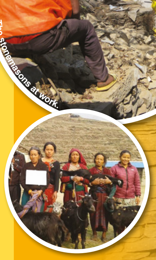
Women receiving new goats, which will provide milk and meat for their families and to sell at market.

They are also helping people to restart their farming businesses by providing livestock, sheds, tools and seeds.