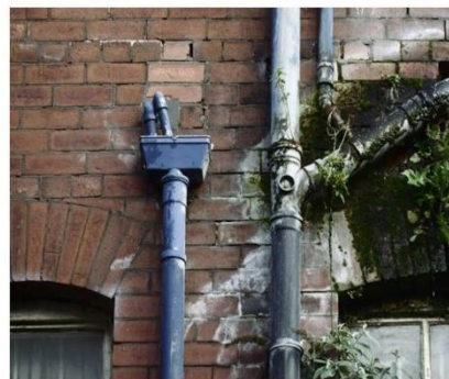
Leaking gutters or drainpipes are often the cause of damp walls. © Historic England Archive. DP169342

Guidance on Annual Property Inspections can be found here . As well, Churches for Cumbria Trust has created a useful Maintenance Checklist to assist those looking after church buildings.