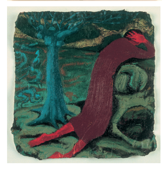
Top: Susie Hamilton (b.1950) Ecce Homo 1999. Acrylic. Above: Mark Cazalet (b. 1964) Fool of God (Christ in the garden) 1993. Oil on paper. Both from the Methodist Modern Art Collection

transparent and consistent desire to follow Wesley's maxim by 'doing all the good he could, by all the means he could'.