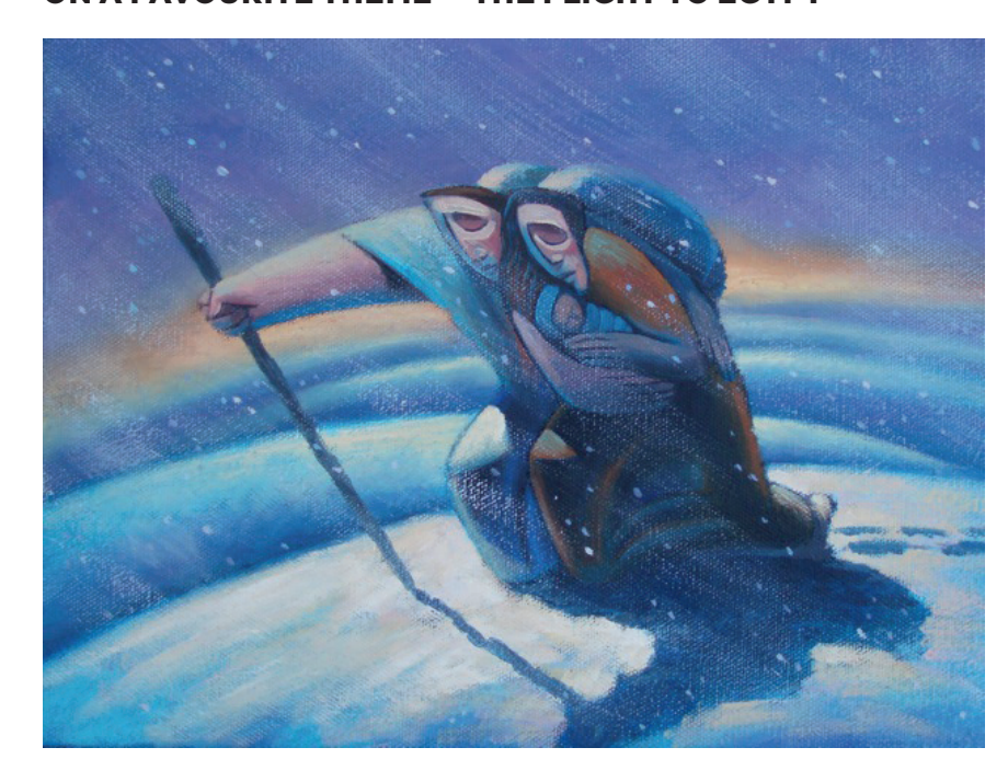
Nicholas Mynheer Flight to Egypt in snow. 2008. Oil on canvas. Copyright the artist

'I find myself drawn time and again to the themes of 'The Flight to Egypt' and 'Rest on the Flight to Egypt'. It never ceases to amaze me how many times one can paint or sculpt a theme and find something different each time to say, or indeed be told.