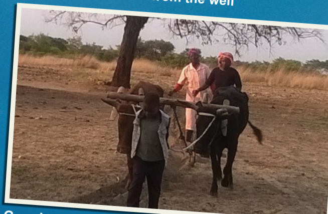
Grandma (Gogo) and children showing how to use a cow-drawn plough