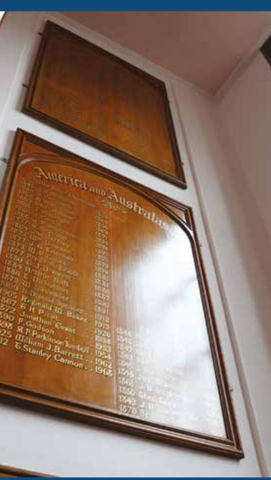
boards now hanging in the Richmond Room at Methodist Marylebone Road, London. Each board lists past ionaries who served overseas in America and Australasia, be and Africa.