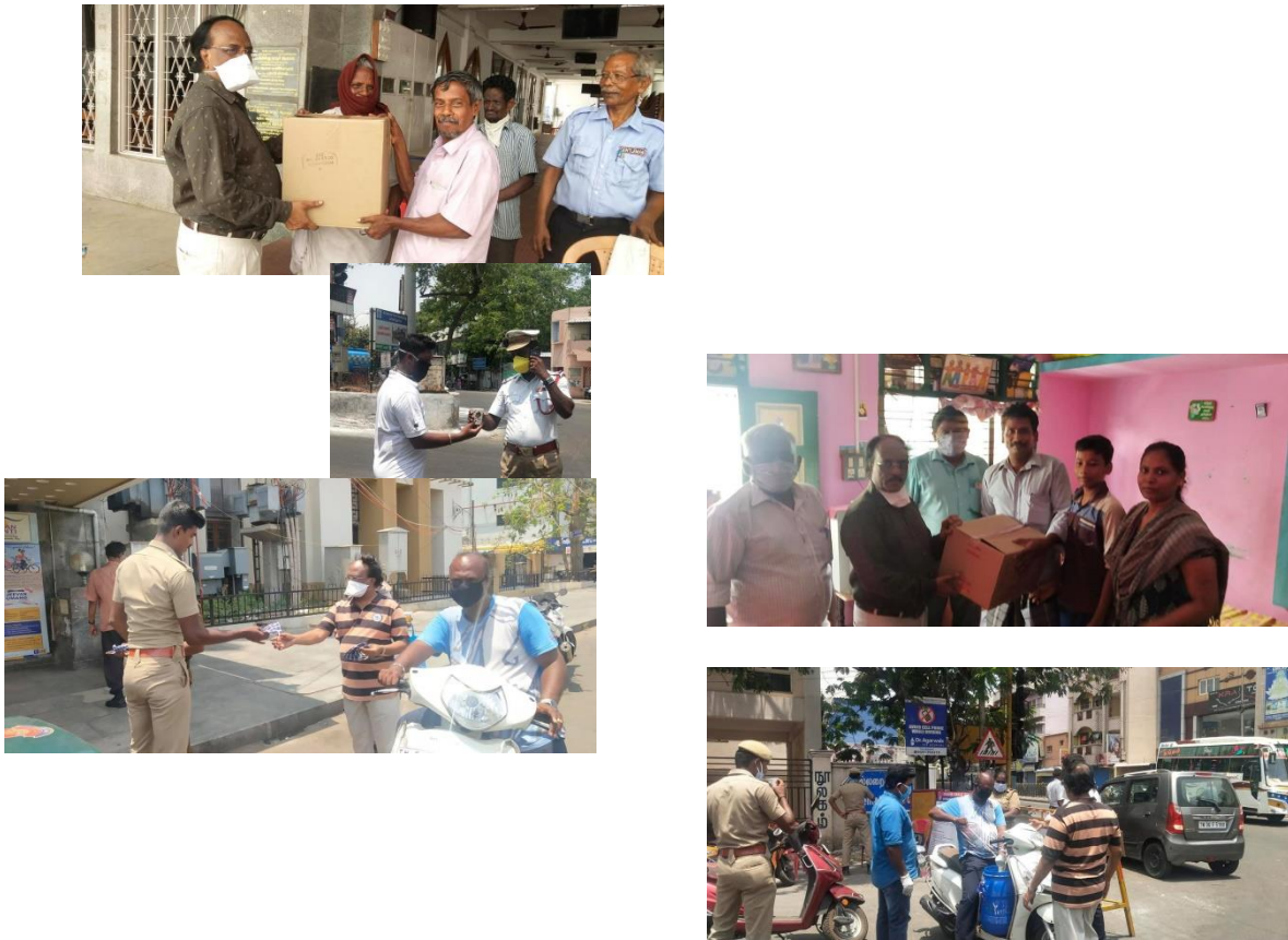
Kanyakumari Diocese- CSI Pastorate Church Keezhkulam celebrating Risen Lord Jesus Christ with the needy in the midst of covid19 April 12/2020 Easter Sunday by providing relief kits