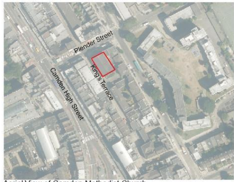
Aerial View of Camden Methodist Church

Distance between TheWesley Euston and 89 Pender St is approximately15 minutes walk.