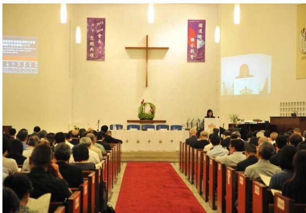
The Conference 2015