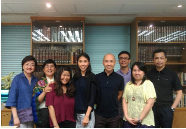
Meeting with the Methodist ministers about the youth ministry