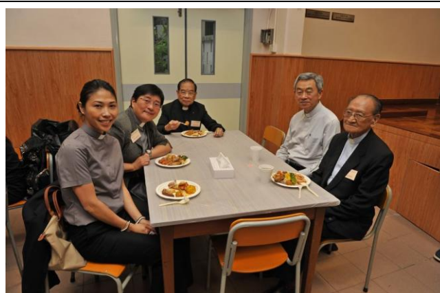
With the Methodist Ministers