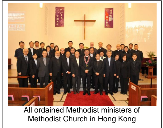
All ordained Methodist ministers of Methodist Church in Hong Kong