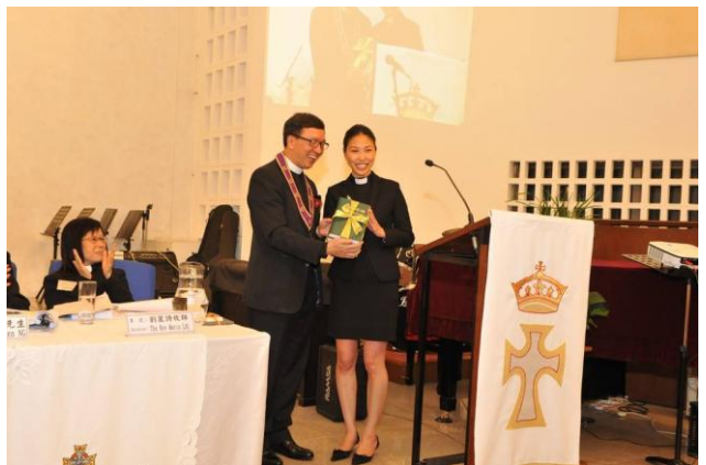
Receiving a souvenir from the Methodist Church in Hong Kong