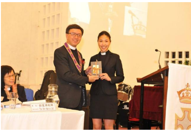
Presenting a souvenir to Methodist Church in Hong Kong