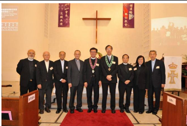
The Methodist Senior Ministers