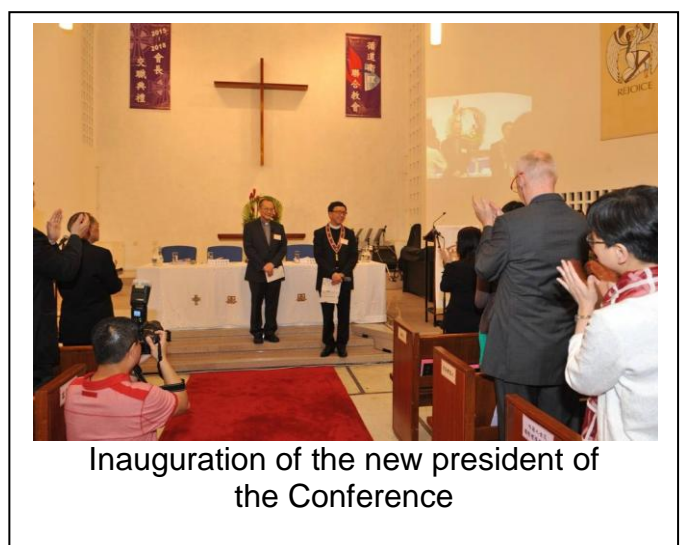
Inauguration of the new president of the Conference