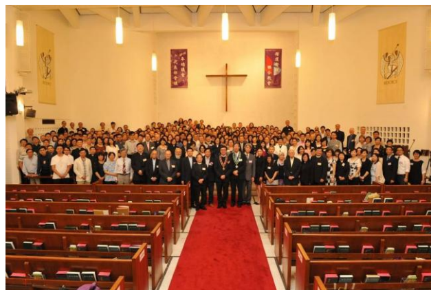
The representatives at the Conference