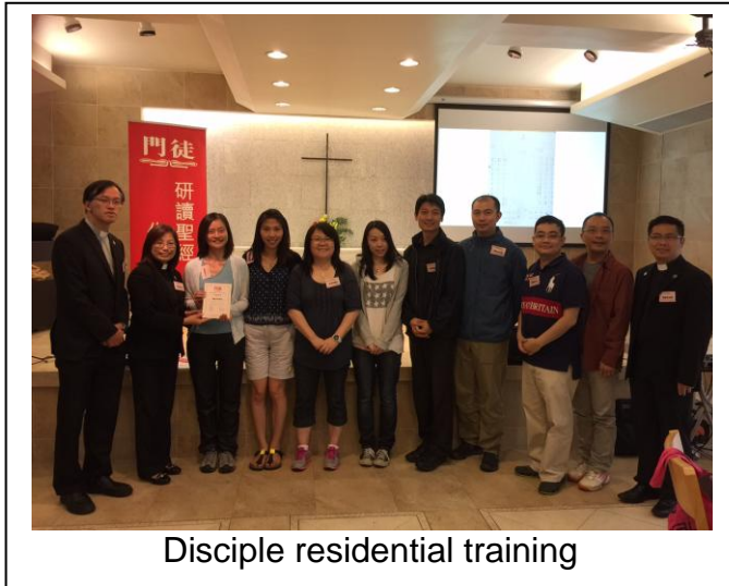
Disciple residential training

communication and working partnership with one another in years to come. I look forward to representing the MCB again next year and bringing the working partnership to the next level.