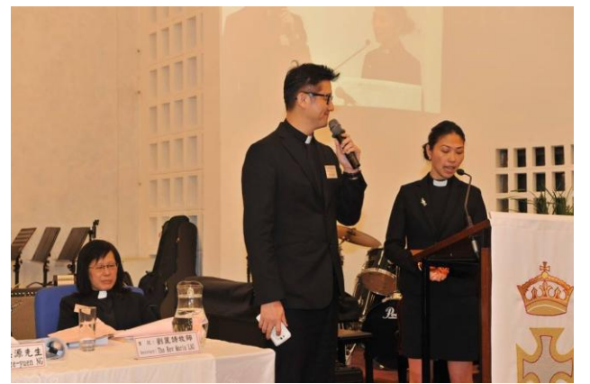
Sending greetings to Methodist Church in Hong Kong in English