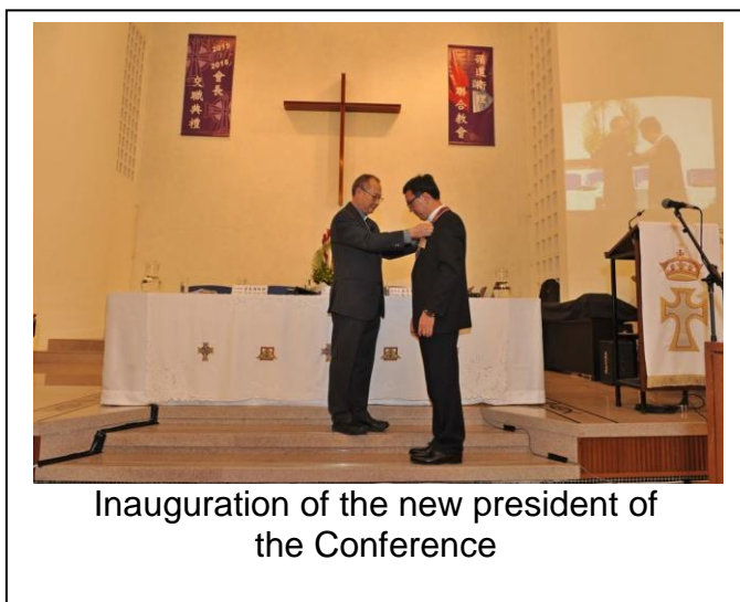
Inauguration of the new president of the Conference