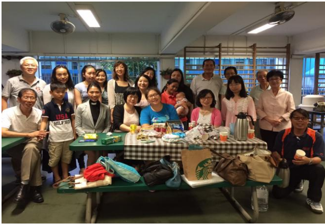
With the Mandarin fellowship